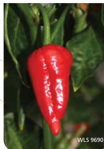
Otros pimientos picosos