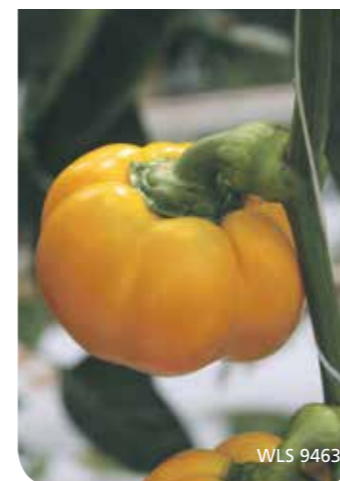
Pumpkin / Tomato pepper